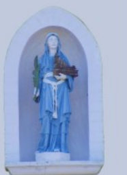
St Cecilia PRAY FOR US

At the end of the presentation each student will be given a book mark as a memento.